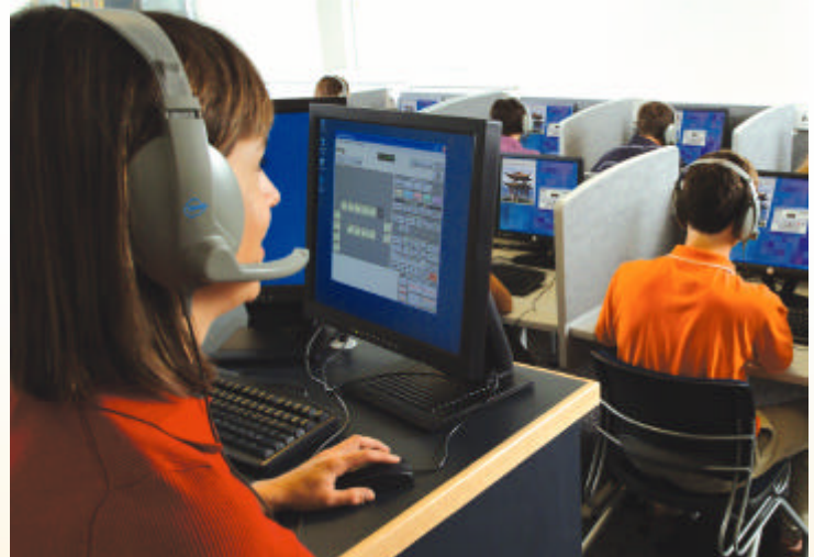
Sony Virtuoso Software + Sony Soloist Software = A Fully Digital Language Lab

? The fully digital language learning systems.