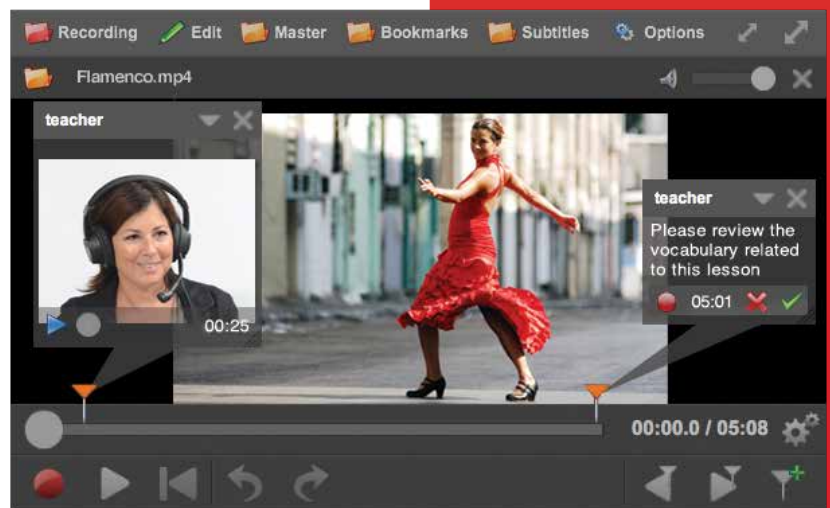
Use the comparative recorder to insert text, audio or video comments.

You provide feedback and guidance simply by inserting text, audio or video comments at any point within a recording. Portfolios or a cumulative body of recordings can be saved, so students have a history of their progress and achievements and can use this information for future academic or career planning.